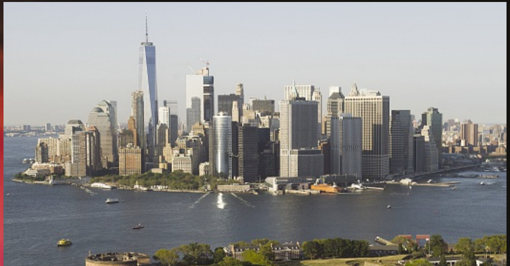
Top of the heap: New York attracted the most FDI projects between 2012 and 2016, and boasts the highest GDP in the rankings

T he bright lights of New York have again outshone every other city on either American continent. The metropolis attracted 819 FDI projects between 2012 and 2016 – the highest number of all locations in this study. Most investment in the city was derived from companies from western Europe (68.6%), followed by Asia-Pacific (14.8%) and North America (6.7%).