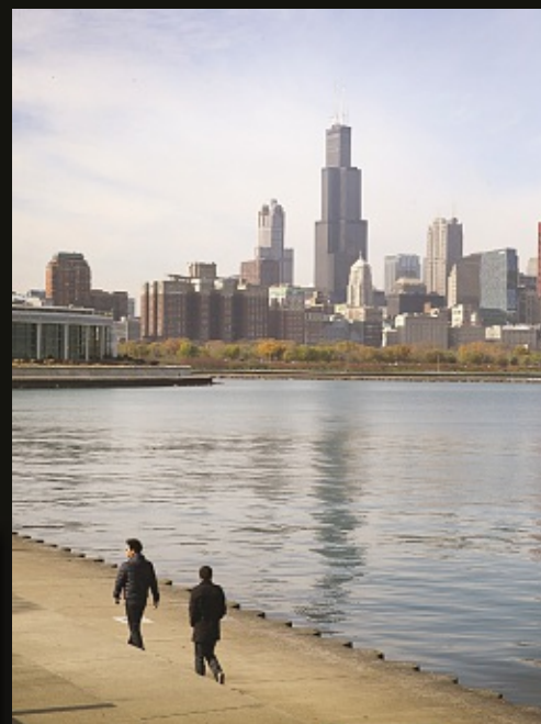
At the summit: Chicago wins the Major Cities FDI Strategy award

Note: List restricted due to shortage of suitable entries.